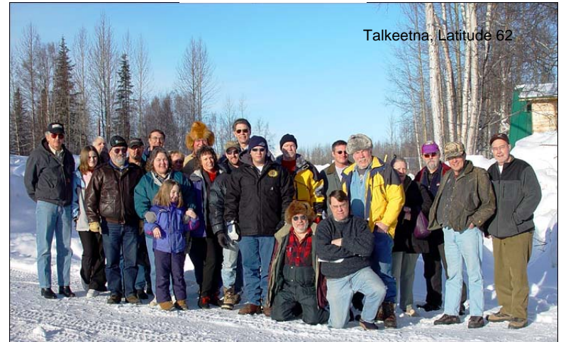
Talkeetna, Latitude 62