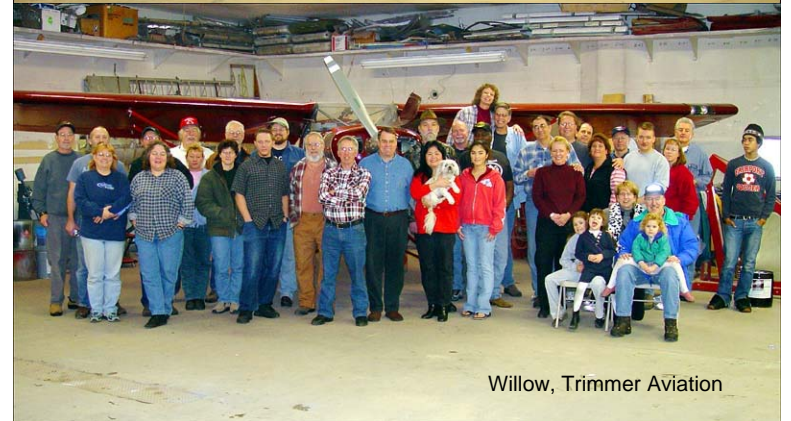
Willow, Trimmer Aviation